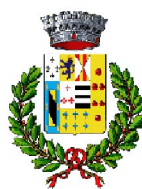
Comune di Santo Stefano di Camastra