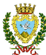
Comune di Erice