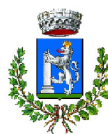
Comune di Burgio